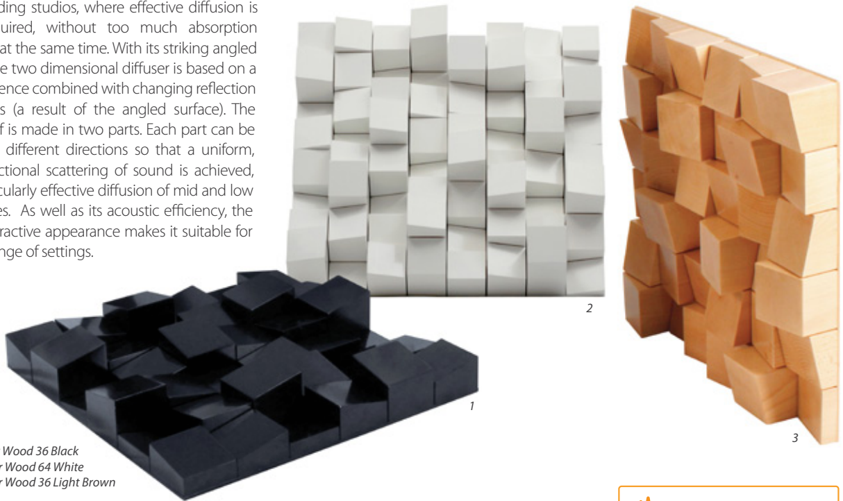
1 - Multifuser Wood 36 Black 2 - Multifuser Wood 64 White 3 - Multifuser Wood 36 Light Brown

Made from solid wood, the new diffuser is perfect for use in venues such as concert halls, hi-fi rooms and recording studios, where effective diffusion is often required, without too much absorption occurring at the same time. With its striking angled surface, the two dimensional diffuser is based on a QRD sequence combined with changing reflection techniques (a result of the angled surface). The panel itself is made in two parts. Each part can be rotated in different directions so that a uniform, omni-directional scattering of sound is achieved, with particularly effective diffusion of mid and low frequencies. As well as its acoustic efficiency, the panel's attractive appearance makes it suitable for use in a range of settings.